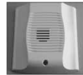
External Sounder provided with base model (DE8310)