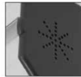
Available with a Built-in Sounder